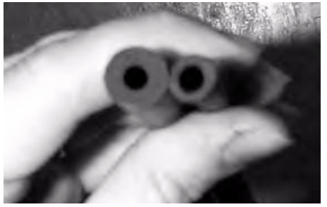
Above: zip oversize hose and the much smaller factory. Note picture taken by zip customer from the internet.

See Large Color Photos of these at www.DocRebuild.com/dr-r-web/vac-hose.html