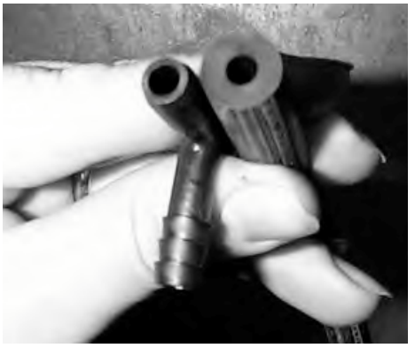
Above: zip T-pipe and the same zip hose. Note picture taken by zip customer from the internet.