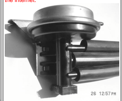
Above: zip hoses and a GM relay valve. See how the oversize hoses fit on that upper nipple. Note photo by Dr. Rebuild.